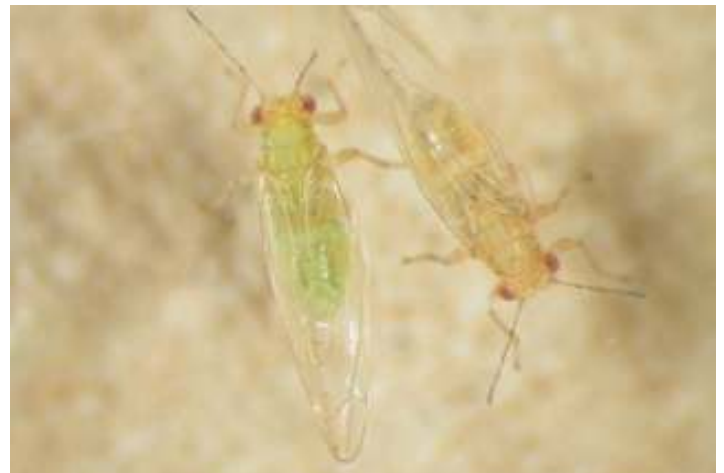
Adult psyllid which are recently emerged and still pale in colour.