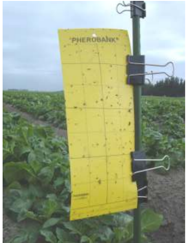
Yellow sticky traps in a potato field.