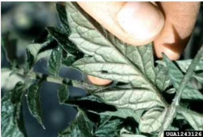
Potato psyllid adult and eggs.

In spring 2009 a number of consultants have recommended that the threshold for spraying should be one potato psyllid nymph per plant , though sprays should not be applied at closer than seven day intervals (or as recommended on the label).