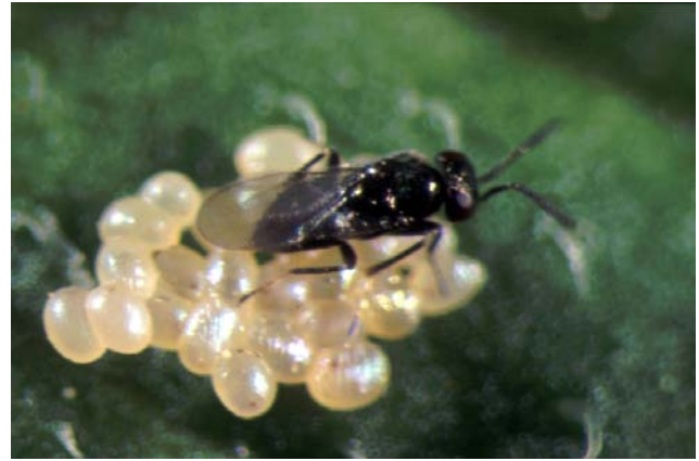
Copidosoma , and parasitizing PTM larvae on left.

reductions in pesticide use, with associated savings (eg from 7 insecticides per crop to none (O'Sullivan & Horne 2000). Growers successfully using IPM include those producing certified seed, crisping, processing, ware and organic crops, and some growers have been using the strategy for over 13 years.