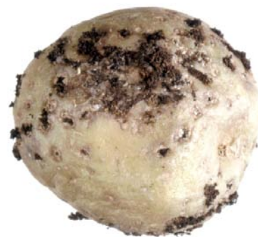
Potato tuber moth and damage to potato crops.

to ours include papers by Briese (1981) and Callan (1974). Studies that we have carried out on the